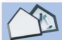
Home Plate w/ Anchor