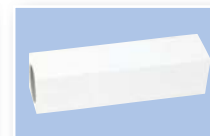
Pro Model 4-Way Pitcher's Rubber