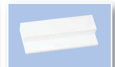
Pro Step Down Pitcher's Rubber