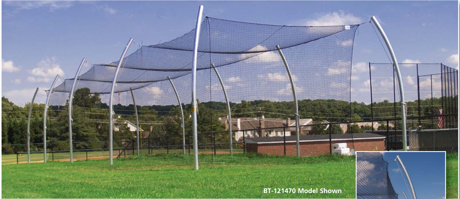
BT-121470 Model Shown