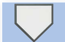
Home Plate - Cherry Hardwood Bottom