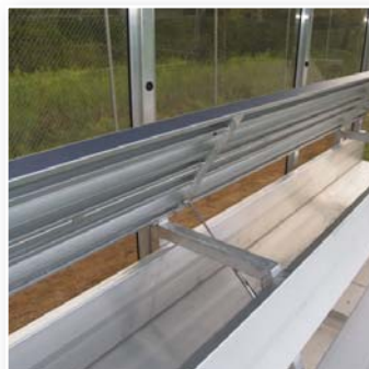
Storage compartment with hinged shelf cover, easily lifts up with pneumatic device.