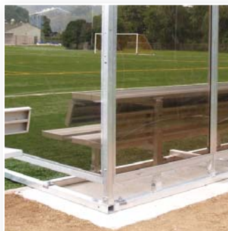
Anchor Solution #1: Shown anchored to concrete pad abutting playing field.