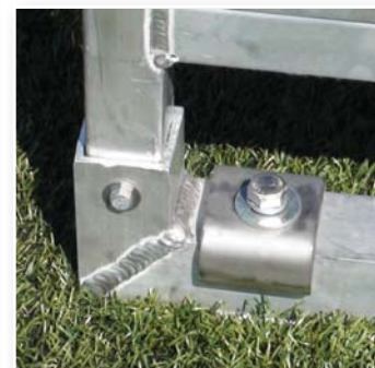
Anchor Solution #2: Shown anchored to concrete pier at corners (4) below artificial turf.