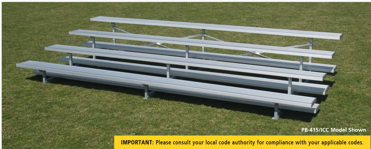
PB-415/ICC Model Shown

IMPORTANT: Please consult your local code authority for compliance with your applicable codes.