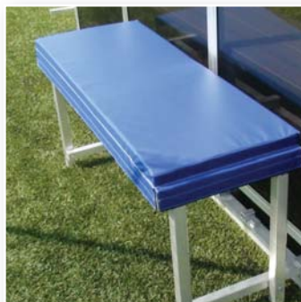
Trainer's Table (optional) designates area for athlete injuries to be addressed.