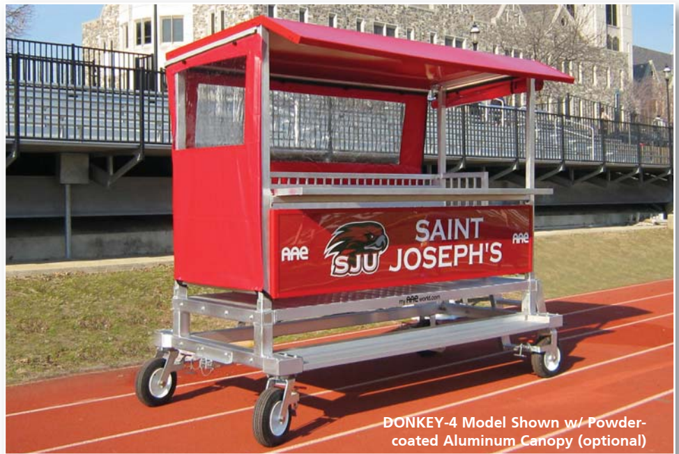
DONKEY-4 Model Shown w/ Powder-coated Aluminum Canopy (optional)