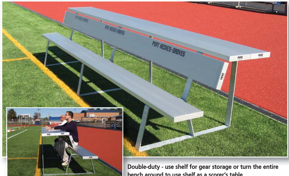
Double-duty - use shelf for gear storage or turn the entire bench around to use shelf as a scorer's table.