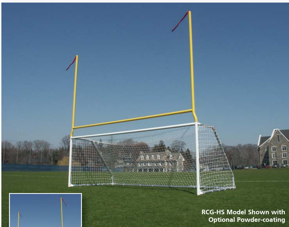
RCG-HS Model Shown with Optional Powder-coating