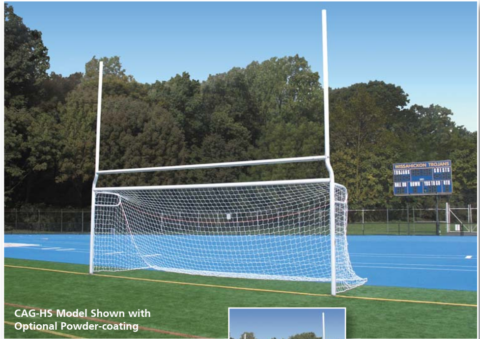
CAG-HS Model Shown with Optional Powder-coating